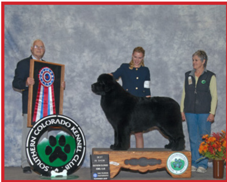
Rico-Best In Show Southern Colorado Kennel Club 2009