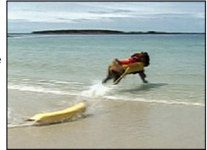
Bilbo has had to pass swimming and fitness tests to join the team

Bilbo has his own lifeguard vest with safety messages written across it to warn holidaymakers not to go beyond the designated swimming and surfing areas.