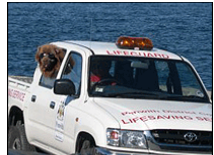
Bilbo patrols at Sennen Cove