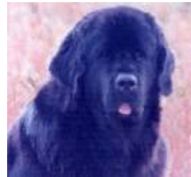
Ch. Lovely Indian Summer Vom Triberg, CD "Leonie"